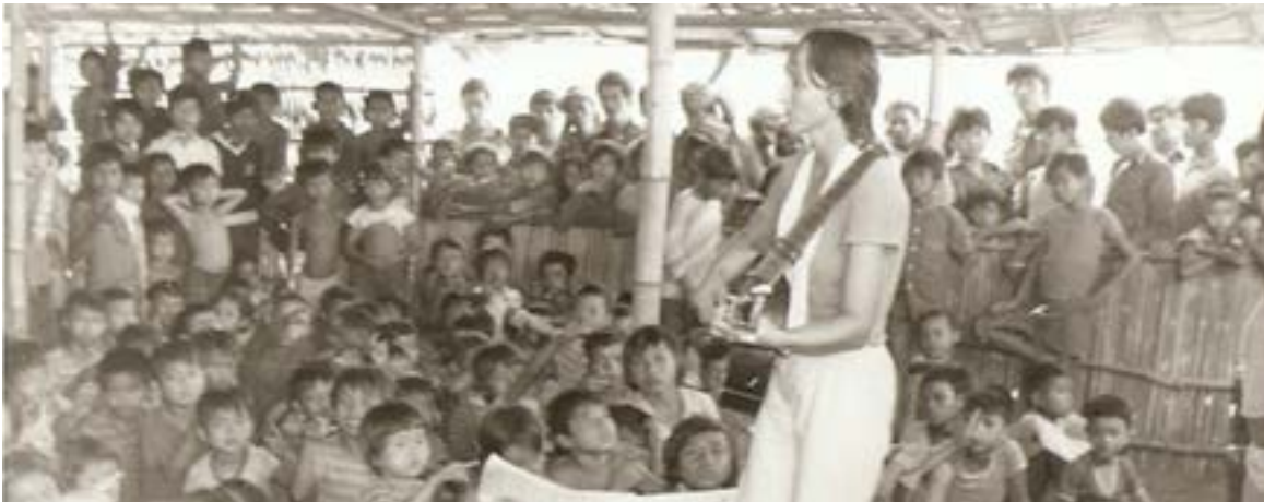
A YWAM Children's Ministry in one of the Khmer Refugee Campus in Thailand.

The refugee camps in Thailand during the 1980's were a place of survival for the Khmer fleeing from the Pol Pot regime , but also became a place of equipping. YWAM along with many other Christian organizations invested intensely and saw a move of God with 100,000's of Khmer becoming followers of Jesus. Thousands were then trained and prepared to go back into Cambodia to begin to share the Gospel and plant churches. In 1991 when the United Nations re-opened Cambodia and prepared to hold elections, millions of Khmer flooded back into their home nation and amongst the returnees were thousands returning as reformers of the Gospel. The result of the move of God in the refugee camps was rapid growth of Christianity that caused Cambodia to be the 9th fastest growing in this millennium.