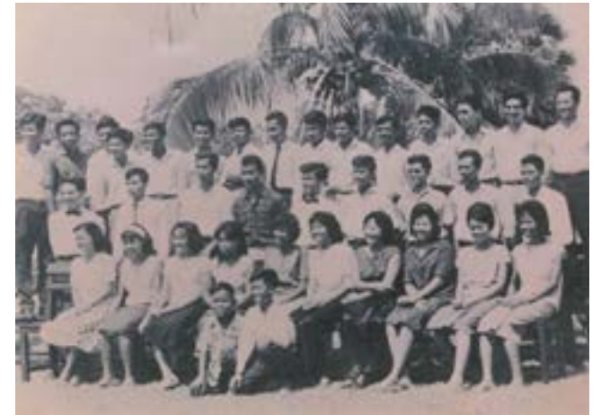
Khmer Christian Youth Camp.