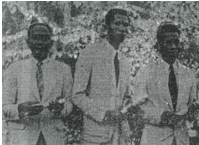
1st Khmer Bible School Graduates.